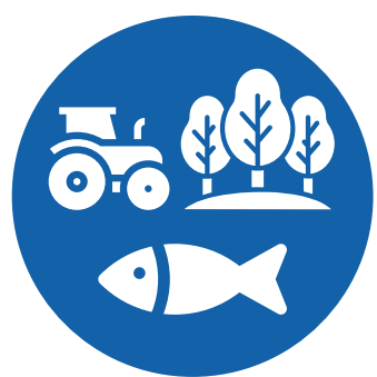
AGRICULTURE, FORESTRY AND FISHING

If you can showcase opportunities in any of these sectors, then we want you to shout about it: