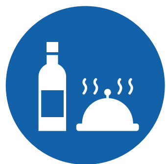
FOOD AND DRINK