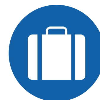
TOURISM AND HOSPITALITY