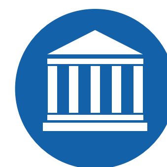
FINANCIAL AND PROFESSIONAL SERVICES